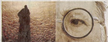
DESERTS OF VAST ETERNITY, ink jet video stills on acrylic, text on card, 11.5" x 30", 2007