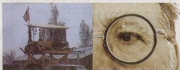
SORRY SCHEME OF THINGS, ink jet video stills on acrylic, text on card, 11.5" x 30", 2007