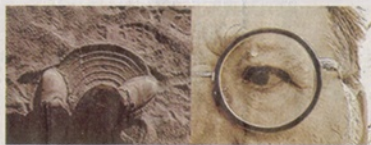
BE EQUAL MADE, ink jet video stills on acrylic, text on card, 11.5" x 30", 2007