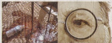
LACK ALL CONVICTION, ink jet video stills on acrylic, text on card, 11.5" x 30", 2007

However, the double images are smaller and there are more of them — 600 to be exact.